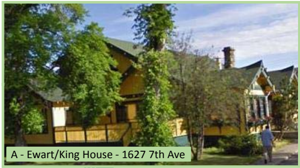
A - Ewart/King House - 1627 7th Ave