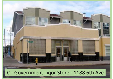
C - Government Liqor Store - 1188 6th Ave