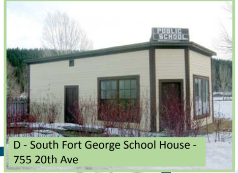
D - South Fort George School House - 755 20th Ave