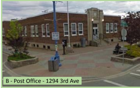
B - Post Office - 1294 3rd Ave